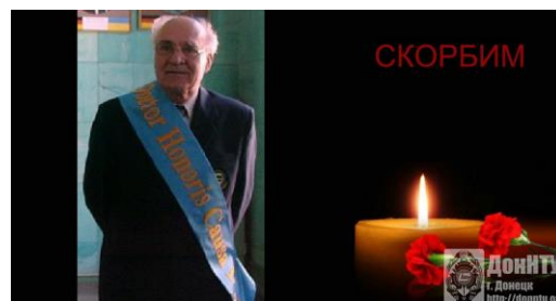
Photo: Site of DonNTU

He started teaching at the Polytechnic Institute of Jassy in 1966. In 1972-1973 he took a course of data processing by grinding in UMIST (London). IN 1975 he defended his dissertation. IN 1983-2003 he worked as the Head of the Department of Machinery Technologies. It was due to his efforts that this structural subdivision was turned into a modern scientific center. Now it is one of the most beautiful and best equipped buildings in the city with the nice atmosphere of research.