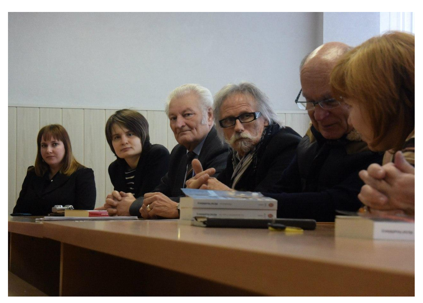
The meeting of the representatives of DonNTU and DonNU with the French Delegation

Then Mr. Clostermann talked to people who passed by at Lenin's Square and he got evidence that the local population supports the ideas of the Republic and do not see themselves as citizens of Ukraine.