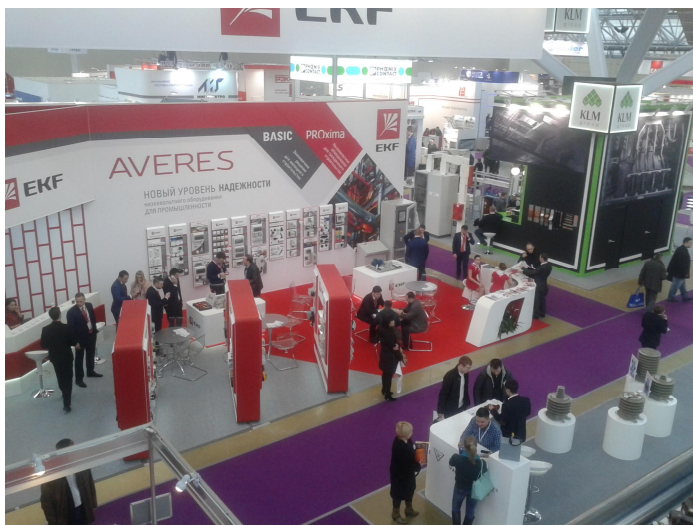
The exhibition "Electro-2017"

We plan to establish close contacts with the equipment producers and organize practice course for students of DonNTU at the companies.