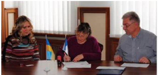
Подписание созлашения о сотрудничестве

The four selected students (out of 15) will have their study course of the first level. Our congratulations to them!