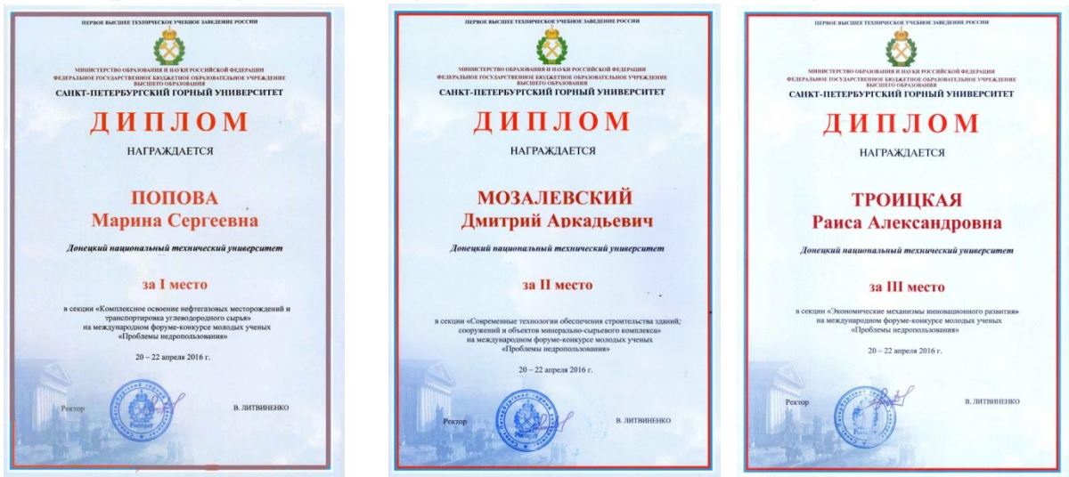
The diplomas our students and researcher were awarded

Our graduates working at the RANIMI ranked second. All in all the delegation of DonNTU representing the DPR got six awards! They also got in touch with the